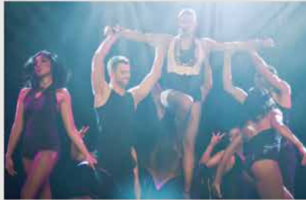
DIRECTOR, PRODUCER AND CHOREOGRAPHER Musical Show: Forever Broadway - Rialto Theatre