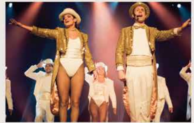
DIRECTOR, PRODUCER AND CHOREOGRAPHER Musical Show: Forever Broadway - Rialto Theatre