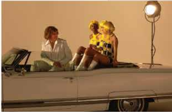
ACTOR AND CHOREOGRAPHER On set with Marc Labrèche