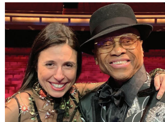
She had the distinct honor of directing Sonny Turner, the iconic 1959 lead singer of The Platters, in Montreal - Place Des Arts.