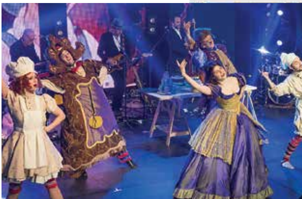
DIRECTOR AND CHOREOGRAPHER Beauty and the Beast Show