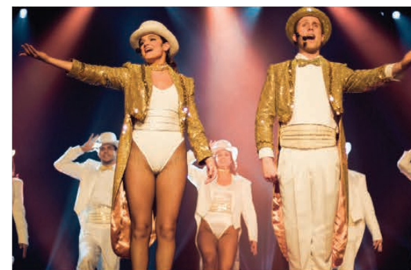
Director, Choreographer & Producer - Musical Show : "Forever Broadway"