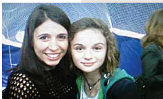
CHOREOGRAPHER On set with actress Joey King for the movie "White House Down"