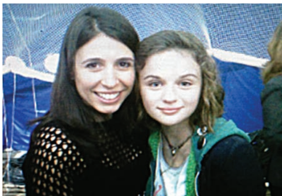
On set with actress Joey King for the movie "White House Down"