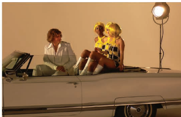
Actor and choreographer - On Set With Marc Labrèche