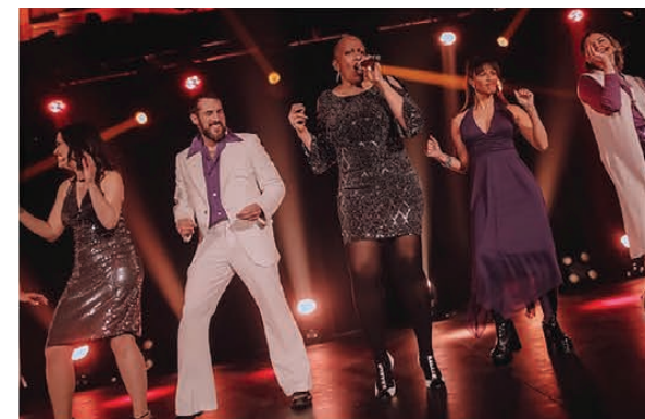
Director & Choreographer for " Saturday Night Fever"