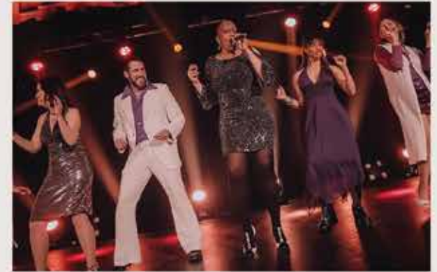
DIRECTOR AND CHOREOGRAPHER Saturday Night Fever