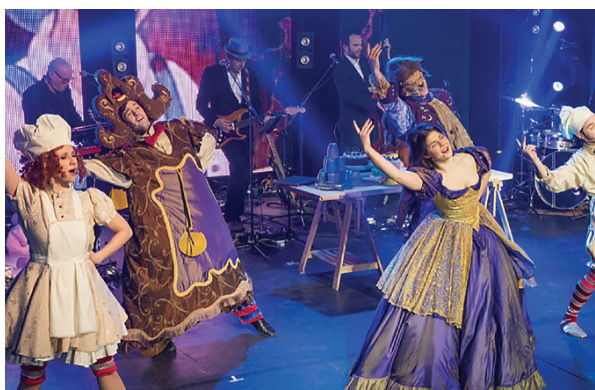
Director & Choreographer for "Beauty and the Beast"