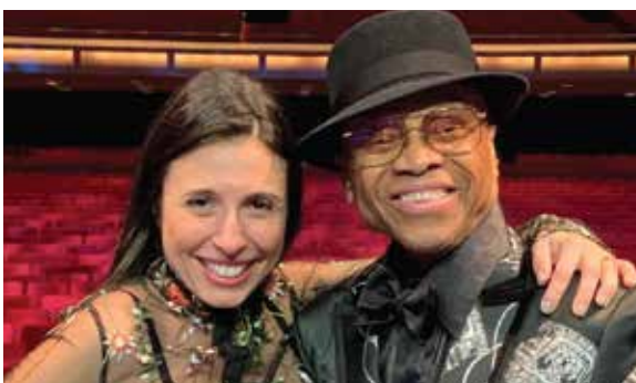
She had the distinct honor of directing Sonny Turner, the iconic 1959 lead singer of The Platters, in Montreal - Place Des Arts.