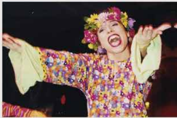
ON STAGE AT CAESAR'S PALACE Atlantic City