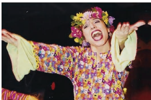
On stage at Caesar's Palace